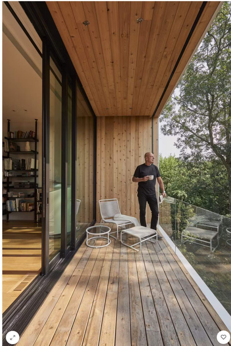
On the third-floor balcony, a rope chair and ottoman from Brown Jordan offer a cozy perch for viewing the trees.