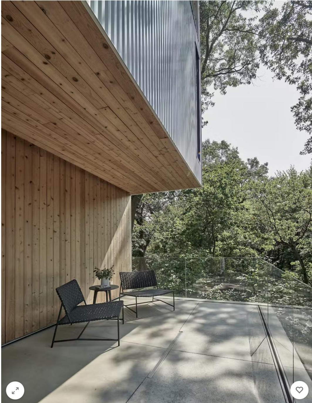
A cedar-clad porch serves as the home's entrance. There are three decks, each oriented for a different view of the site.

The result is a 2,200-square-foot home set atop the site's highest point, nicknamed Tree House by the designers because of its upright, three-level plan. In part, its shape was out of necessity. "The property is quite steep, and there were some restrictions from the local municipality about where we could and could not build," explains McFadden. "That meant we had to focus on a limited footprint." Because the volume had to move up instead of out, the designers decided to invert the standard multilevel floor plan by locating the primary living spaces on the top level.